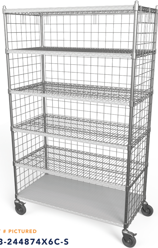
PART # PICTURED 153-244874X6C-S