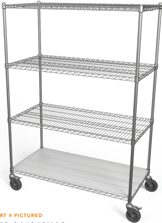
PART # PICTURED 153-244863X4C