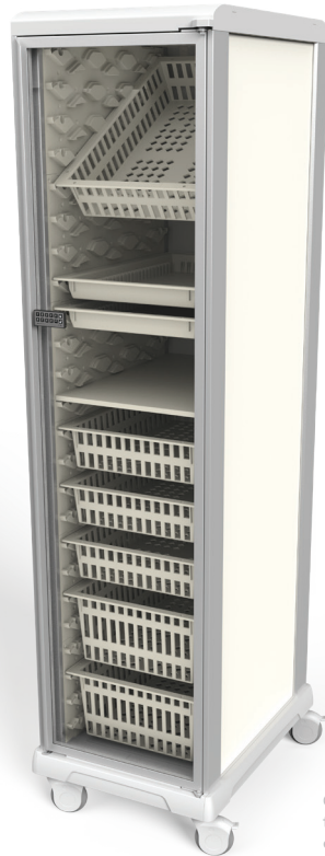
Cart shown with optional trays, baskets, and electronic keyless lock

Dimensions (WxHxD): 21.488" x 82" x 28.532"