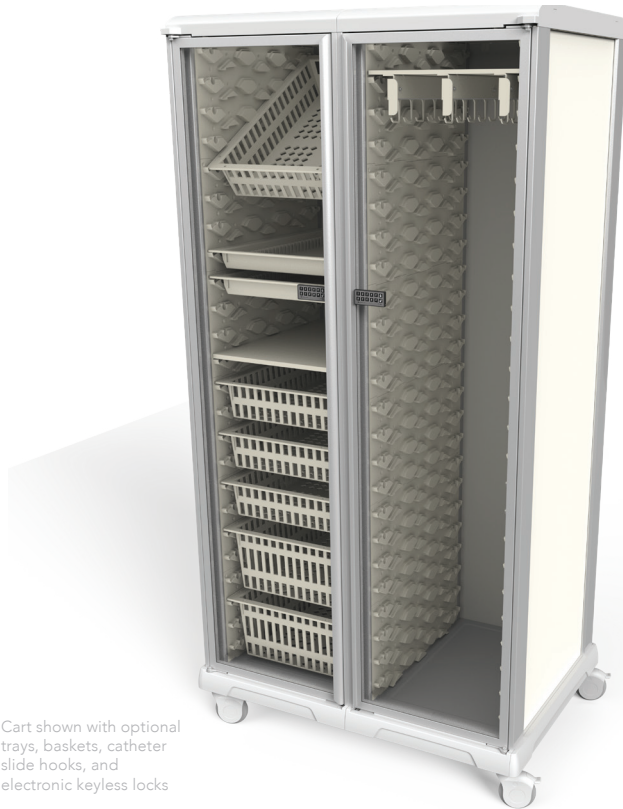
Cart shown with optional trays, baskets, catheter slide hooks, and electronic keyless locks

Dimensions (WxHxD): 41.322" x 82" x 28.532"