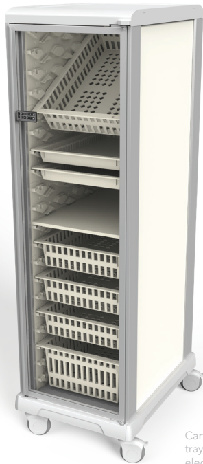
Cart shown with optional trays, baskets, and electronic keyless lock