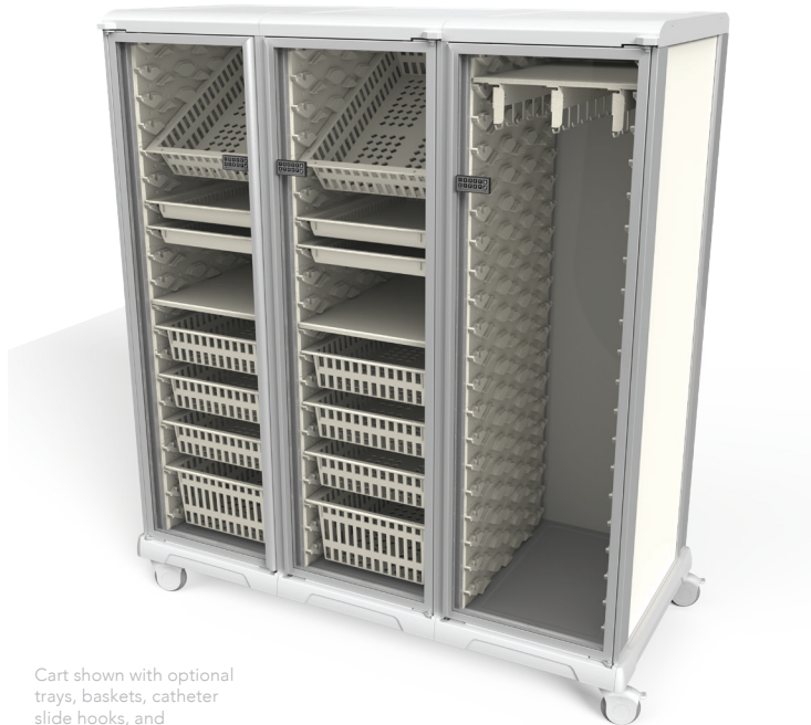
Cart shown with optional trays, baskets, catheter slide hooks, and electronic keyless locks

Dimensions (WxHxD): 61.156" x 70.25" x 28.532"