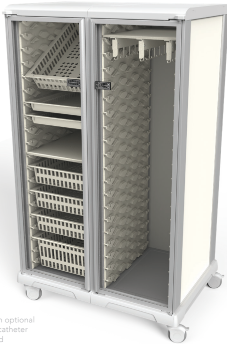
Cart shown with optional trays, baskets, catheter slide hooks, and electronic keyless locks

Dimensions (WxHxD): 42.322" x 70.25" x 28.532"