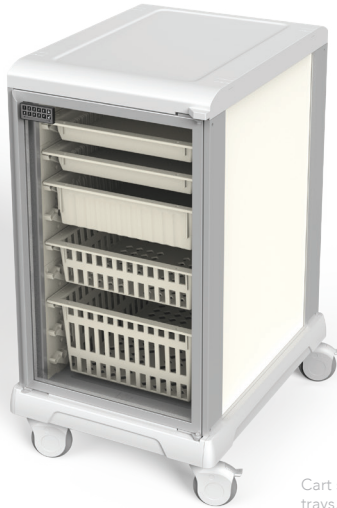
Cart shown with optional trays, baskets, and electronic keyless lock

Dimensions (WxHxD): 21.488" x 40.5" x 28.532"