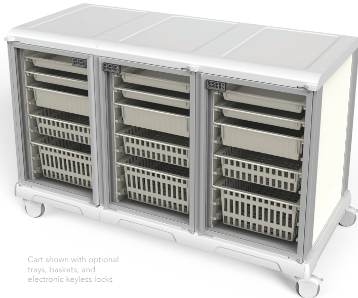
Cart shown with optional trays, baskets, and electronic keyless locks

Dimensions (WxHxD): 61.156" x 40.5" x 28.532"