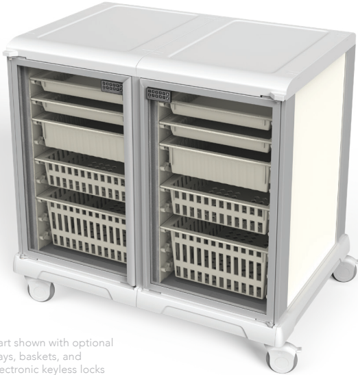
Cart shown with optional trays, baskets, and electronic keyless locks

Dimensions (WxHxD): 41.322" x 40.5" x 28.532"