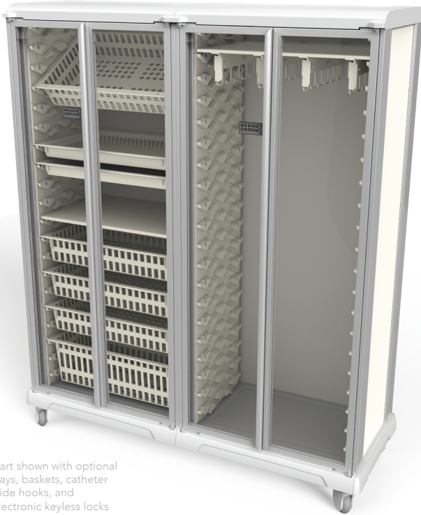
Cart shown with optional trays, baskets, catheter slide hooks, and electronic keyless locks

Dimensions (WxHxD): 56.96" x 70.25" x 20.704"