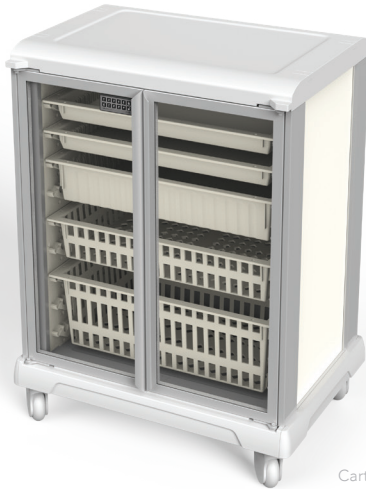
Cart shown with optional trays, baskets, and electronic keyless lock

Dimensions (WxHxD): 29.307" x 40.5" x 20.704"