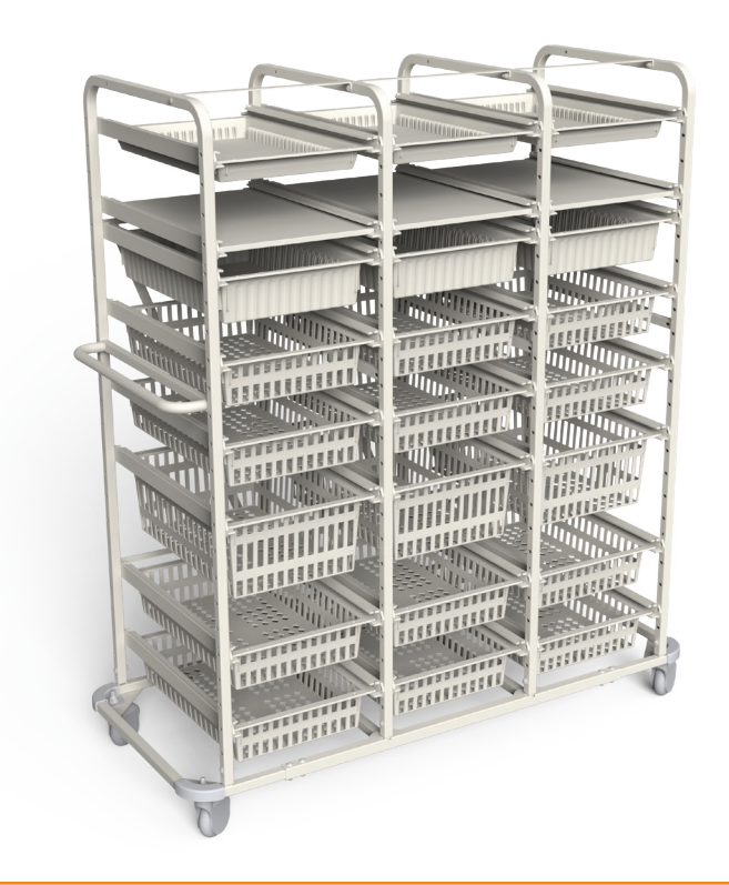
Dimensions (WxHxD): 60.22" x 70.6" x 25.84"